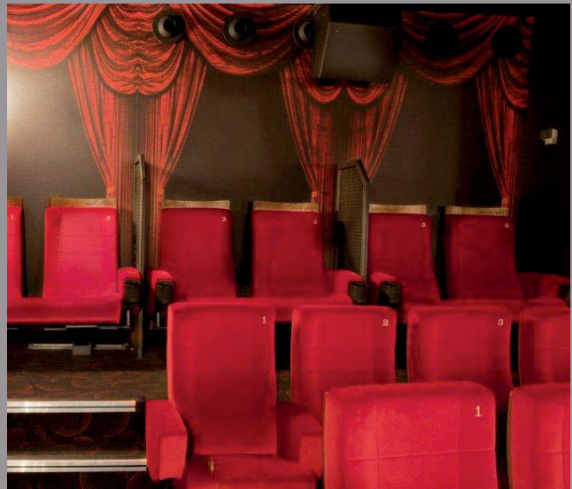
Cinema (Switzerland) - Installation: LEZZI Sarl

The visual and technical results were completely successful, and the acoustic performance is excellent, much to the high overall satisfaction of the management and the audience.