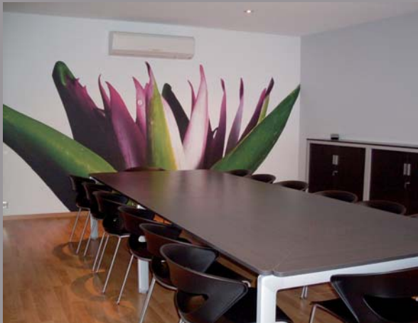
Meeting room (France) - Installation: CLIPSO