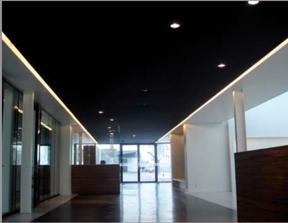
Company entrance hall (Belgium) - Installation: MonaVisa Architect: Architextuur-Thomas Coucke