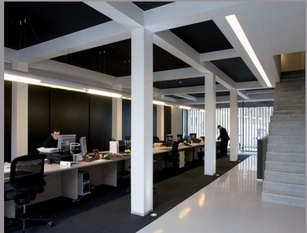
Offices (Belgium) - Installation: MonaVisa Architect: Lineos-Chris Vantornout

CLIPSO USA Inc. 3742 W. Century Blvd Unit # 7 Inglewood, CA 90303 USA